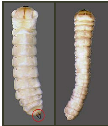
Figure 7. Comparison of prepupa of emerald ash borer (left) and red-headed ash borer (right). Circle shows two spines (urogomphi) on emerald ash borer larva