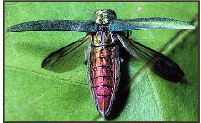
Figure 3. Emerald ash borer adult

EAB larvae (Figure 6) are recognized by their enlarged and flattened pronotum, elongate body shape with abdominal segments one to seven trapezoidal, abdominal segment eight bell-shaped, and the last abdominal segment round with two spines (urogomphi, Figure 7).