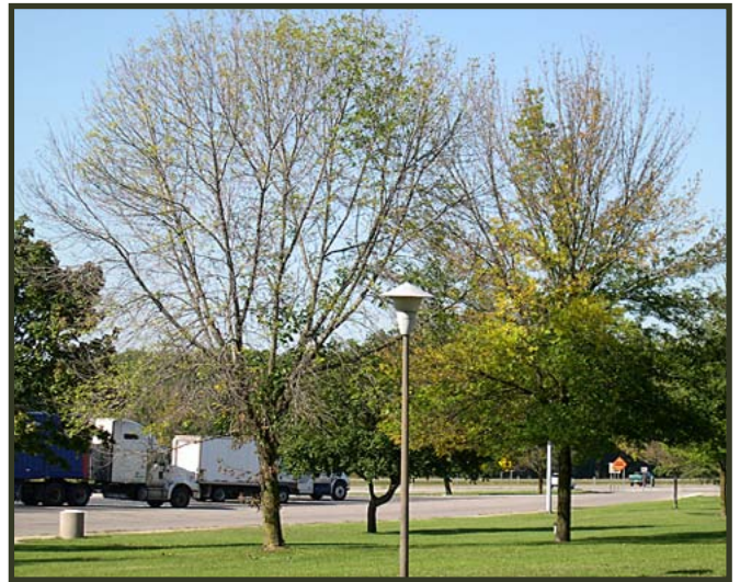
Figure 14. Dieback of tree crown