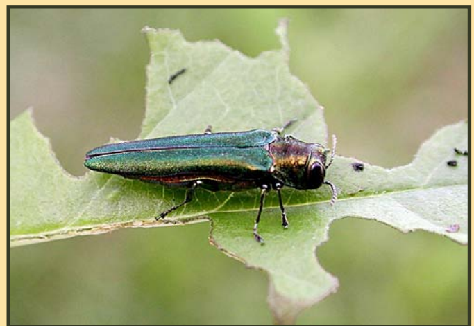
Figure 10. Emerald ash borer adult feeding on an ash leaf

Adults live for only three to six weeks and feed on foliage for one to two weeks prior to mating. Foliar feeding by EAB adults causes little damage to the ash tree (Figure 10). They mate and repeat the life cycle.