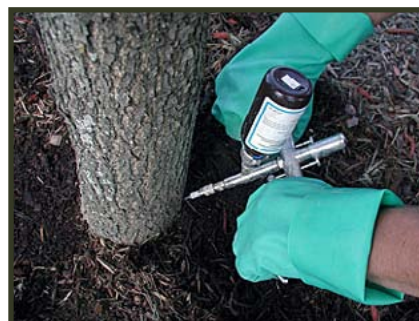
Figure 20. Trunk injection for control of emerald ash borer

Imidacloprid trunk injections resulted in less mortality and varying degrees of EAB control. Overall, trunk-injected emamectin benzoate provided the highest level of EAB control when compared with other insecticide products and application techniques.