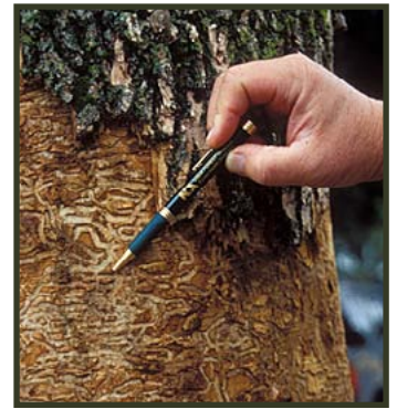
Figure 13. Larval galleries of emerald ash borer

Visible symptoms of damage are dieback of the tree crown (Figure 14) and excessive sprouting (epicormic branches) along the main stem of the tree (Figure 15). However, these symptoms are unlikely to be seen during the first year of infestation. Instead, dieback probably will be observed only in trees that have been infested for three years or longer.