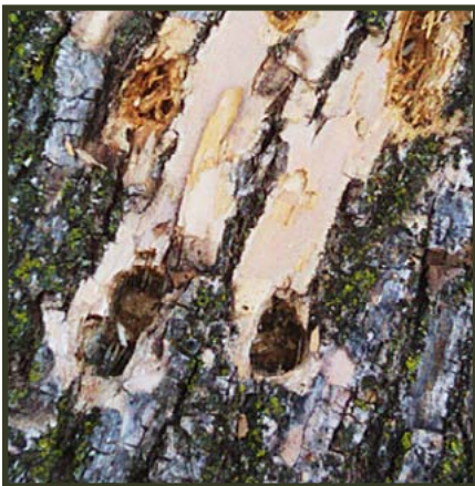
Figure 16. Woodpecker damage on emerald ash borer-infested tree

Beyond removal and replacement, the loss of benefits provided by ash trees will be enormous and expensive. Shelterbelts protect farmsteads, fields and livestock from harsh, drying winds in the summer and they capture snow in the winter, acting as living snow fences along highways and around many communities. In urban EAB-infested areas where ash trees have been destroyed, the loss of shade/protection from ash trees has resulted in increased costs associated with summer air conditioning and lawn watering, and home heating in the winter.