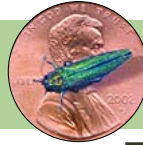
Figure 2. Size of emerald ash borer adult compared with a penny

Adults are recognized as metallic, wood-boring beetles (Family Buprestidae) by their short saw-toothed antennae, blunt head and elongate yet compact body with metallic coloration.