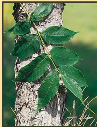
Figure 12. Black ash tree