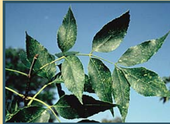
Figure 11. Green ash tree (J. Zeleznik, NDSU)