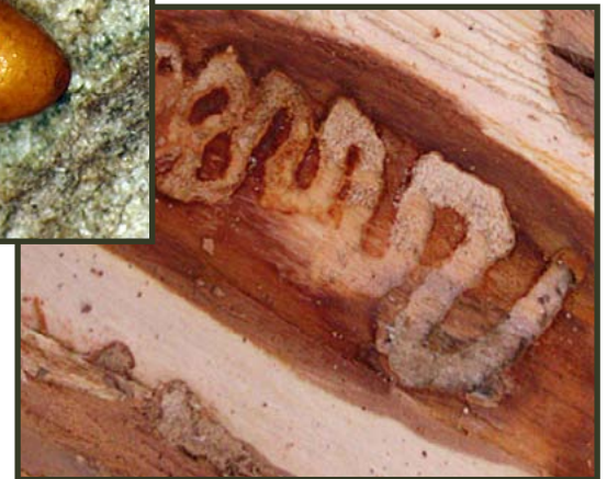
Figure 5. Serpentine tunnel created by emerald ash borer larva