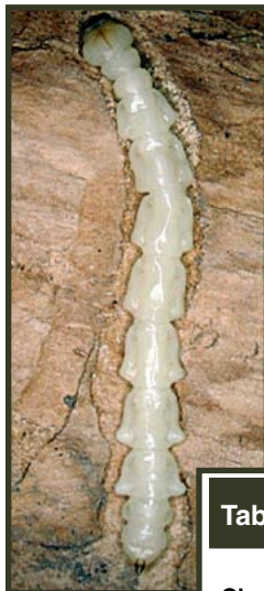
Figure 6. Emerald ash borer larva