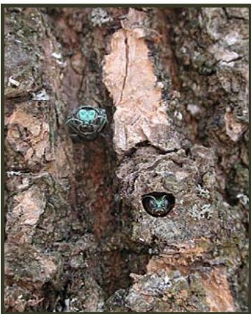
Figure 9. D-shaped emergence hole of emerald ash borer