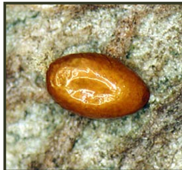
Figure 4. Emerald ash borer egg