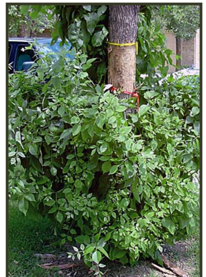
Figure 15. Epicormic branching from tree attacked by emerald ash borer