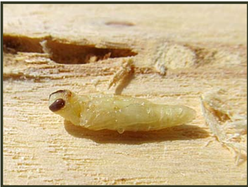
Figure 8. Emerald ash borer pupa

As the beetle within develops, the pupa takes on the adult form. When the adult emerges, the pupal exuvia (shed skin) remains in the pupal chamber. By contrast, two other common ash-boring insects, ash/lilac borer ( Podosesia syringae ) and carpenterworm ( Prionoxystus robiniae ), have the pupal skin partially or mostly extruded from the adult exit hole. Buprestids of the genus Agrilus , such as EAB, leave D-shaped emergence holes (Figure 9).