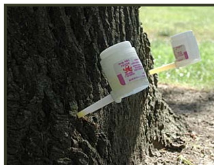
Figure 21. Mauget capsule injection for control of emerald ash borer