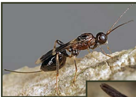
Figure 18. Spathius sp., parasitoid of emerald ash borer

Although what role exotic and indigenous parasitoids will play in suppression of EAB is not clear, researchers hope these parasitoids will become established and reduce infestations and the spread of EAB in North America.