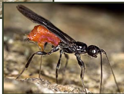
Figure 19. Atanycolus sp., parasitoid of emerald ash borer