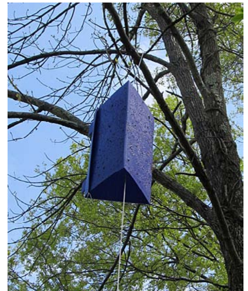
Figure 17. Purple prism trap used for surveying for emerald ash borer

Simple visual monitoring by the general public is also critical because the trapping materials and techniques have not been perfected yet. If you suspect that EAB is in your ash trees, contact one of the organizations listed at the end of this publication.